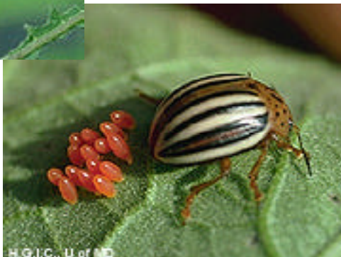
Colorado potato beetle and eggs