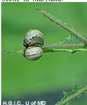
Colorado potato beetle larvae

Control: It is important to monitor plants from the time they are set out in the garden, for signs of larvae and adults. If only a few are present, hand pick and destroy them. Prevent potato beetle problems by protecting transplants as soon as they are set out with floating row cover. Bacillus thuringiensis var tenebrionis (M-TRAK®) may be used to control young larvae in heavy infestations. There are up to 3 generations of this beetle in Maryland.