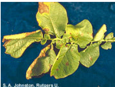
Early blight on leaf

Control: Avoid overhead watering and lay down a thick organic mulch to prevent soil splashing onto lower leaves. Remove infected leaves during the growing season and discard all badly infected potato plant debris at the end of each season to limit overwintering of spores. Chlorothalonil, mancozeb and fixed copper fungicides can be used to prevent or slow infection.