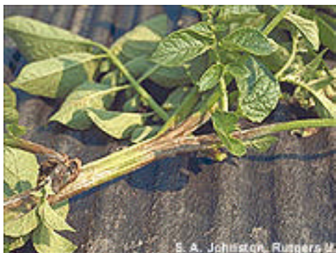
Late blight on stem